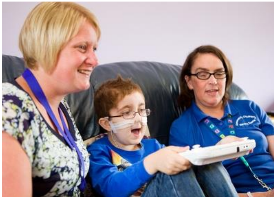
Cambridgeshire Community Services NHS Trust: delivering excellence in children and young people's health services