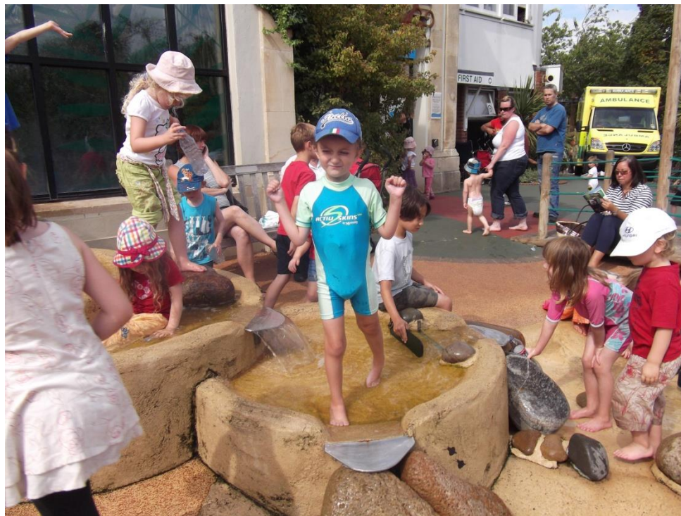
Cambridgeshire Community Services NHS Trust: delivering excellence in children and young people's health services