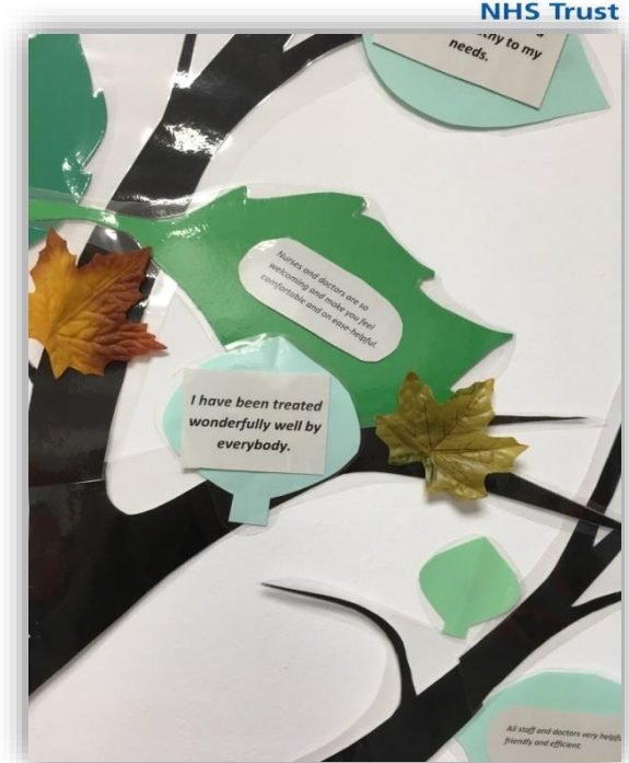
'Friends and Family Feedback Tree'