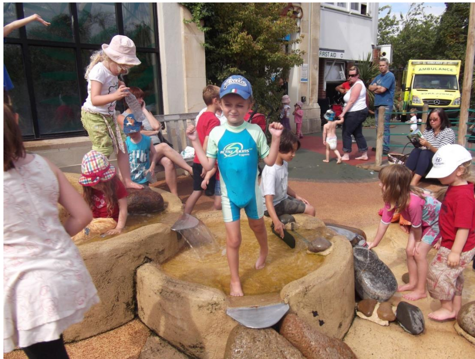
Cambridgeshire Community Services NHS Trust: delivering excellence in children and young people's health services