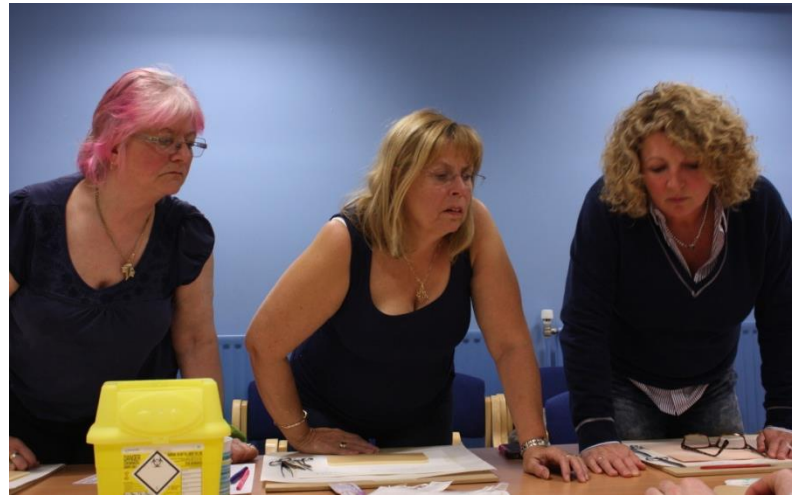
Nipple reconstruction textile workshop