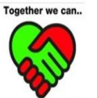
Residents R Us