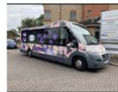
The Thrive Bus